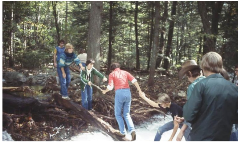
Crossing a river takes teamwork. 1979.