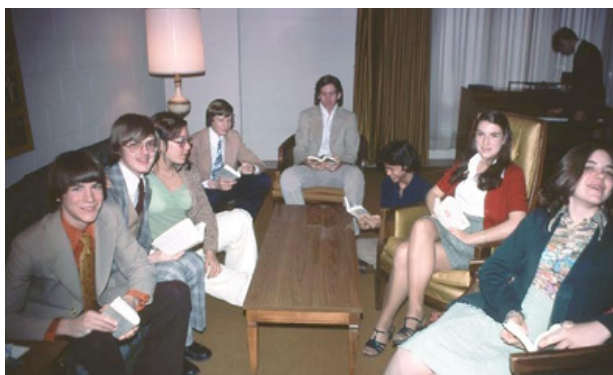
Left: A class convenes, early 1976.