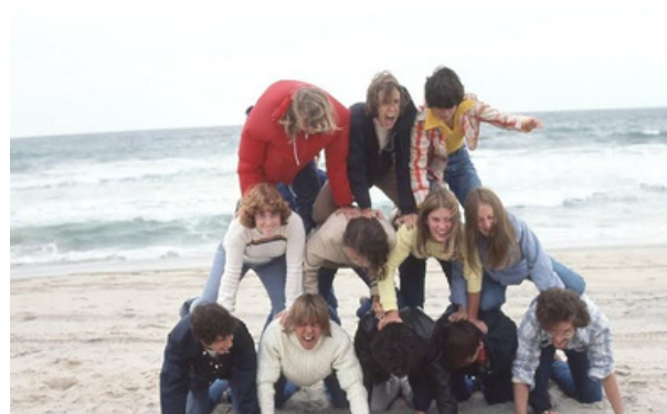
Right: Youth take time out on a retreat to Chincoteague, Virginia, fall 1977.