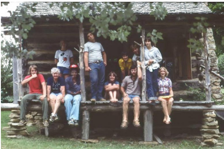
The senior high youth accomplish a good deed, summer 1979.