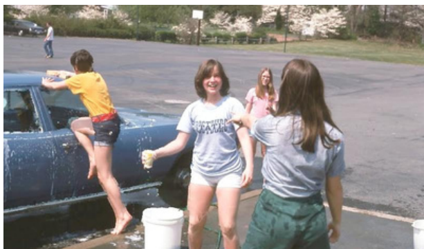
Youth hold a carwash at church, spring, 1976.