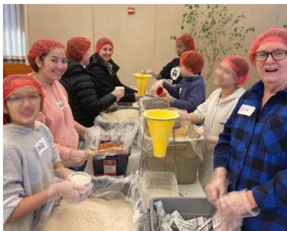
On February 17, we partnered with St. Mark Presbyterian Church to pack more than 25,000 meals for people experiencing hunger crises, through the organization Rise Against Hunger.