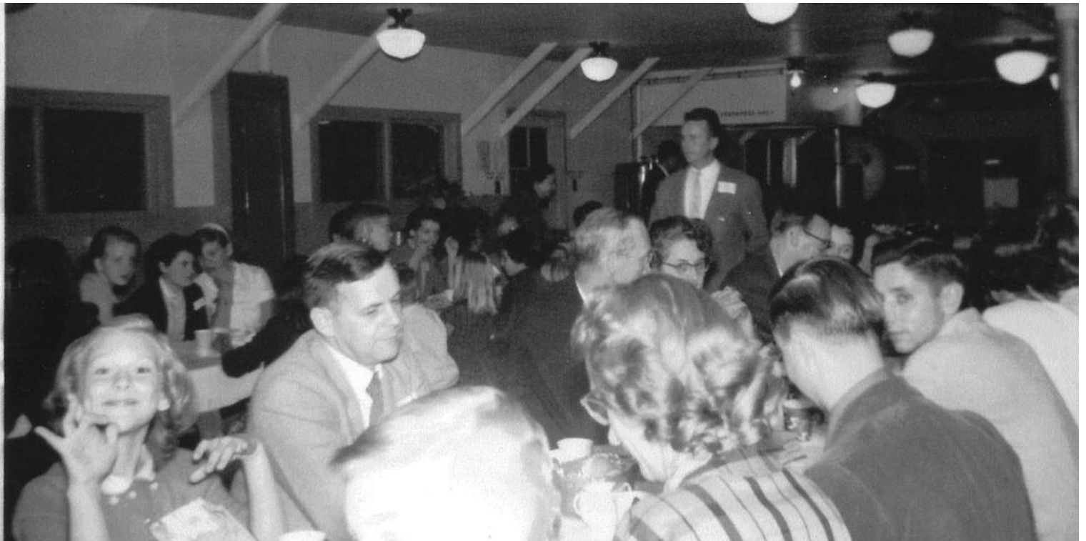
A girl reacts to the photographer at the first Christmas “affair” held by our church, in barracks of the National Guard, in 1956.