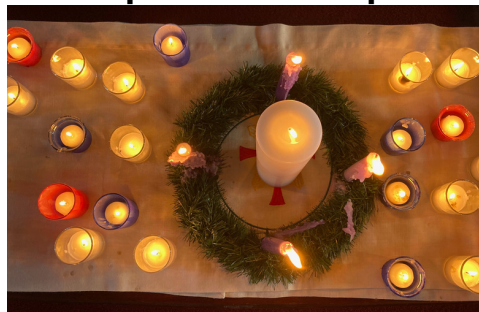
Light for a blue Christmas on the longest night of the year, December 20th.