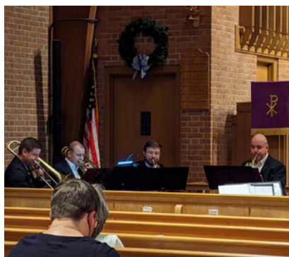
And a brass quartet!