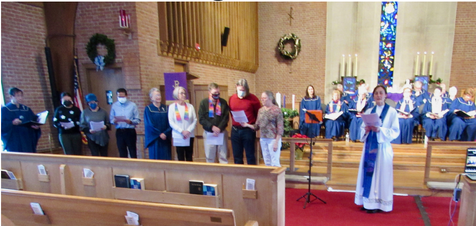
New Members with their sponsors during Lessons and Carols December 18, 2022 (p. 6)