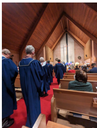
Our augmented choir